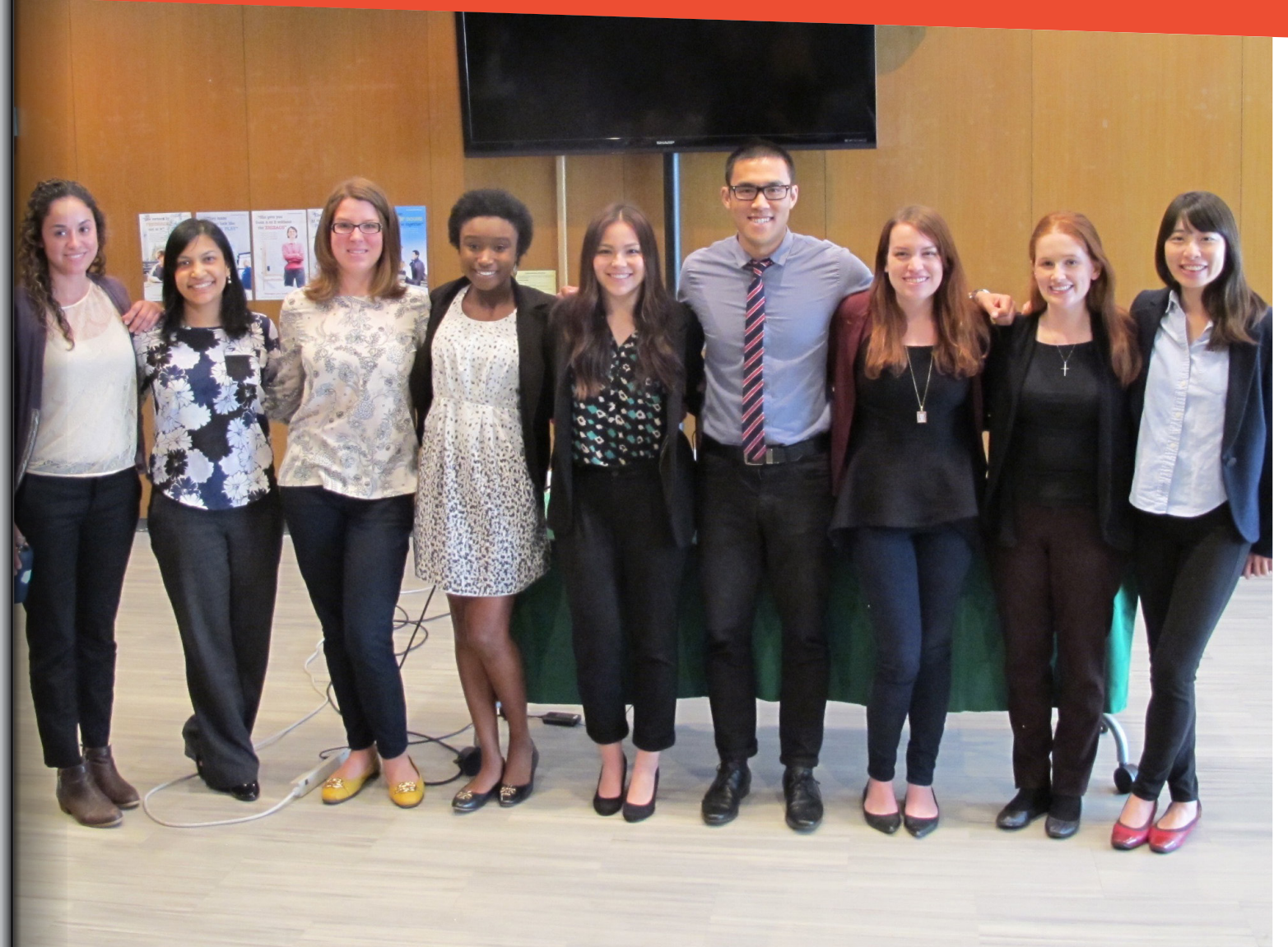
The 2016 graduating MCH class.

The UCB MCH Program is a Center of Excellence in MCH (formerly known as the MCH Leadership Training Program) supported by the Health Resources Services Administration (HRSA) Maternal and Child Health Bureau (MCHB) . Centers of Excellence in MCH further the development of a workforce that is knowledgeable about public health principles that focus on children and families. All MCH training programs aim to promote comprehensive, coordinated, family centered, and culturally sensitive systems of health care that serve the diverse needs of all families within their communities.